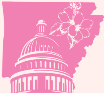
Northwest Regional Representative Vacant